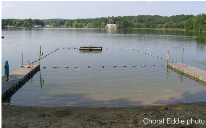
Choral Eddie photo

1. Last spring, owners with riparian rights (owners of lake-front property or those with deeded lake rights) to Lower Rhoda Pond were notified by the Department of Environmental Conservation (DEC) that Camp Pontiac and Lower Rhoda Pond Homeowners Association (LRPHOA), had applied for a DEC permit to use herbicides to kill the aquatic weeds at the north end of the lake and in the west cove.