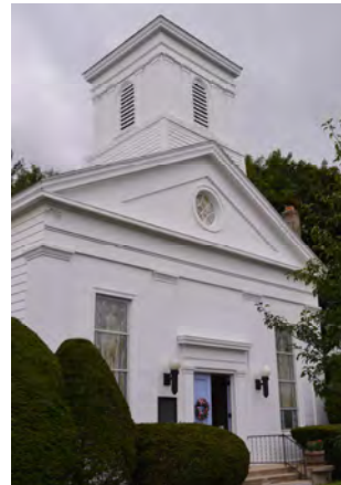
The Ancramdale Presbyterian Church pictured here and St. John's Lutheran