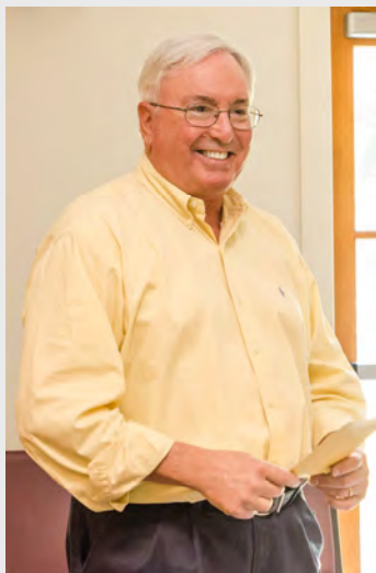
Art introduces the display on Ancram's one room school houses in the new Historic Vestibule, July 2013.

Nominated by both the Democrats and the Republicans